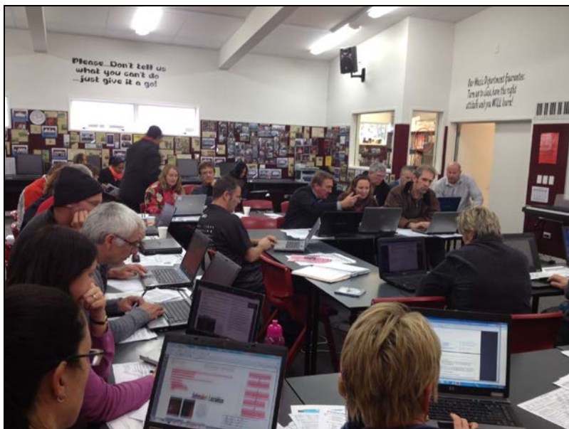
Waikato technology teachers explore the standards alignment process during a teacher only day workshop at Hauraki Plains College on June 15.