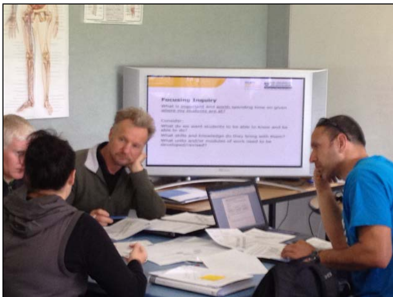
Teachers discuss standards alignment in Health and Physical Education at a workshop facilitated by Team Solutions as part of the Tairāwhiti Secondary Principals Association teacher only day in Gisborne on July 30.

One feature of our workshop delivery this year has been our capacity to support regional principals associations in their local teacher only days, with a particular focus on supporting teachers and middle leaders with the standards alignment process at NCEA levels 2 and 3. By mid-August, Team Solutions facilitators will have delivered 51 workshops for over 1,000 middle leaders and teachers as part of our support for regional teacher only days organised by principals associations in Waikato, Northland, Gisborne and Hawke's Bay. This is in addition to a range of other regional workshops being offered throughout the Northern and Central North regions.