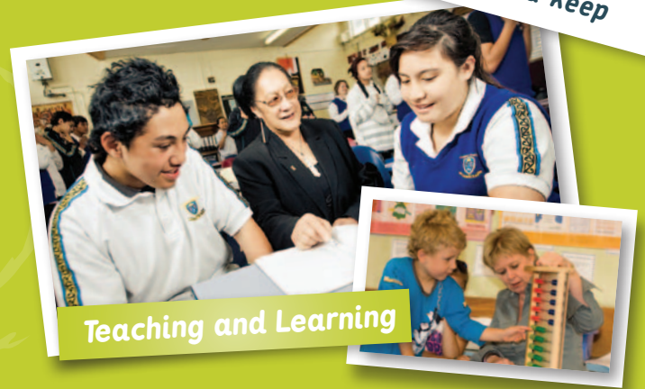
Teaching and Learning